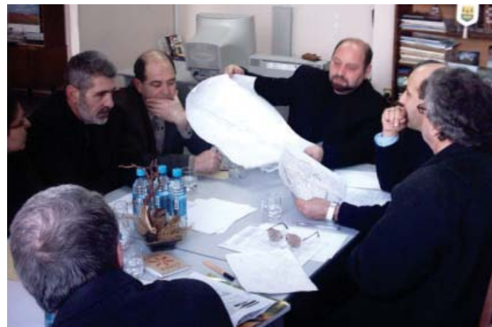
Consultation between the authorities in the concerned countries is key to successful transboundary EIA.